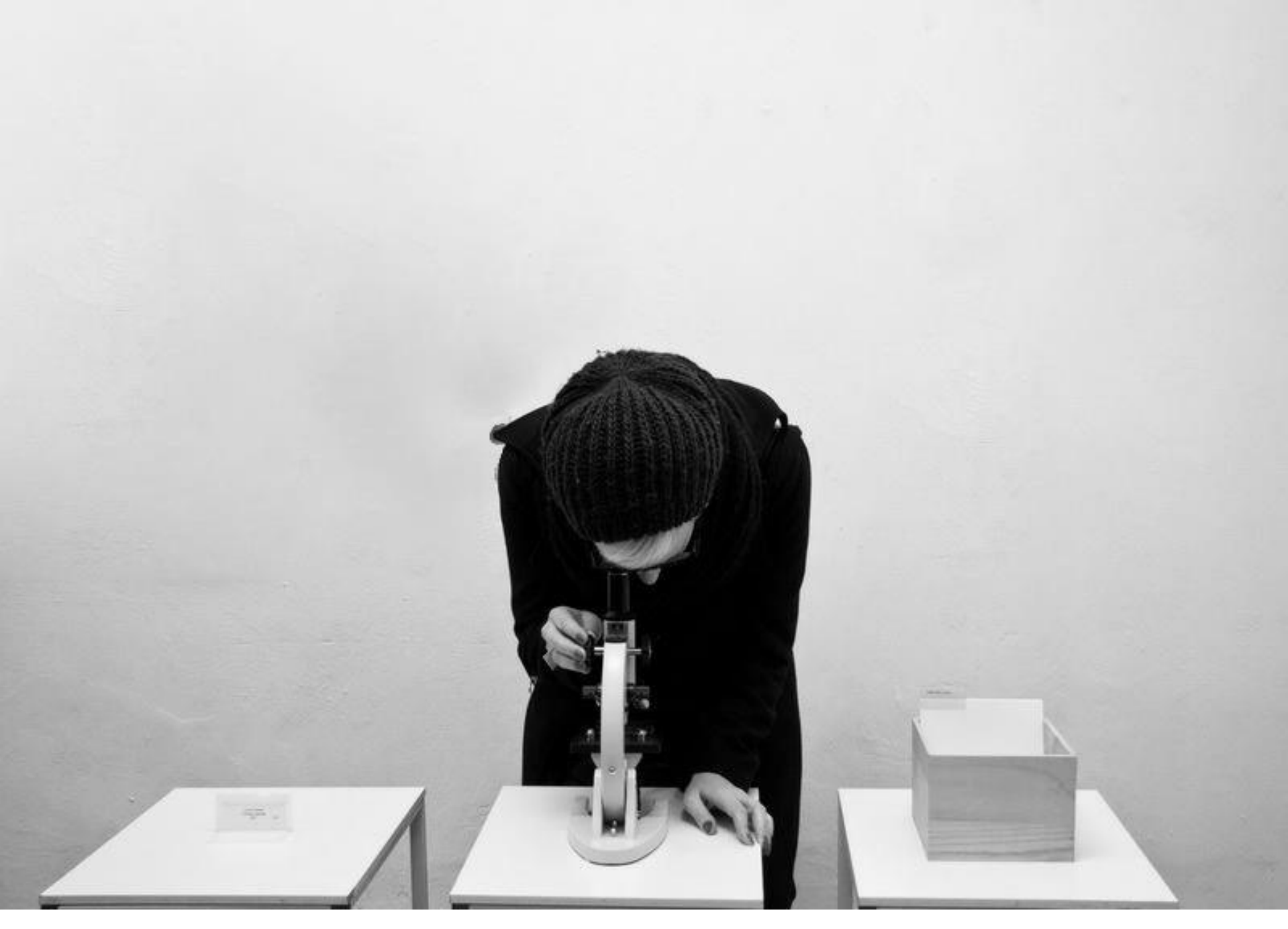
Cabinet de regard: Lucio Fontana, 2017 curated by motelb, Spazio Pachiderma, Brescia, Italy