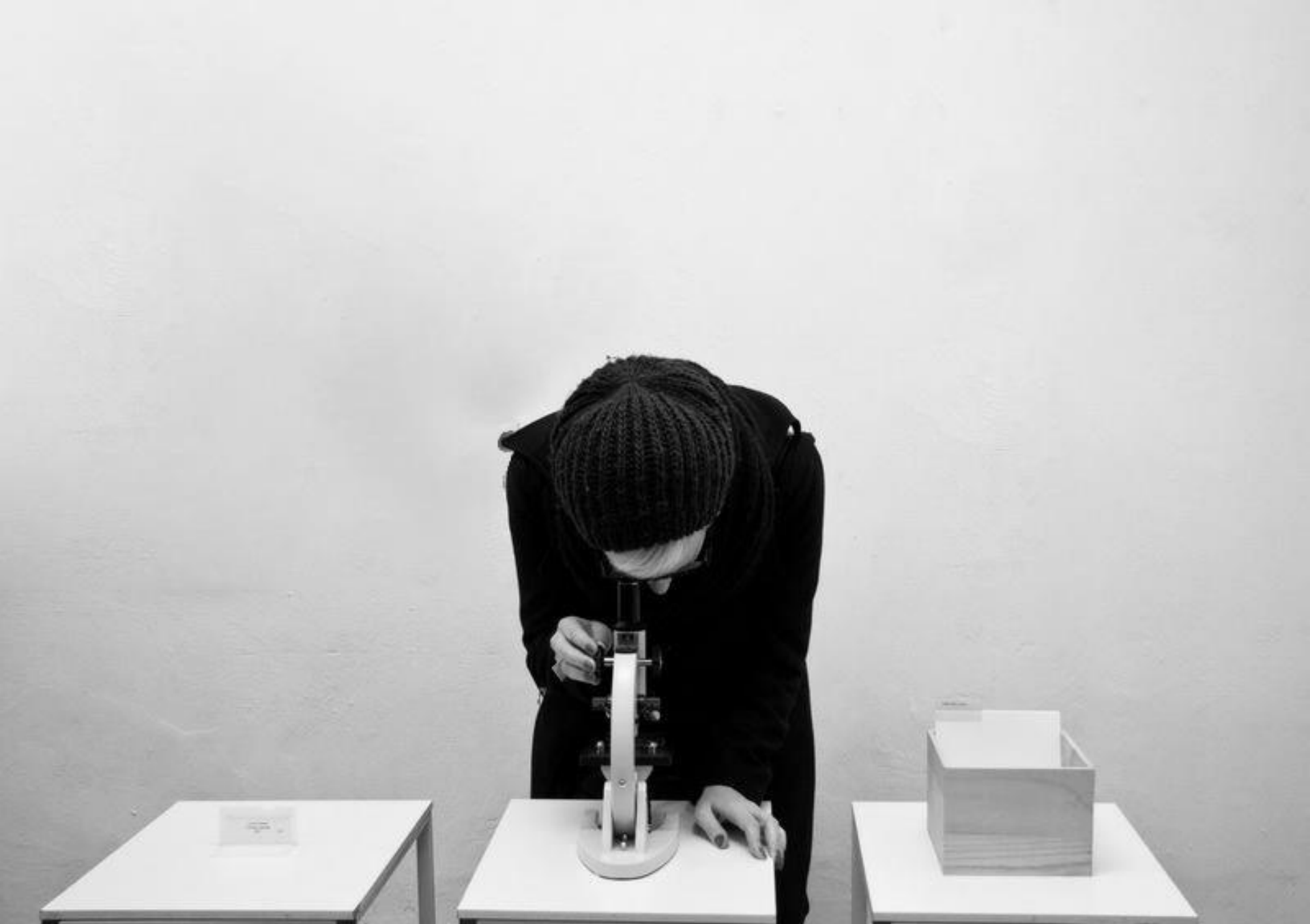
Cabinet de regard: Lucio Fontana, 2017 curated by motelb, Spazio Pachiderma, Brescia, Italy