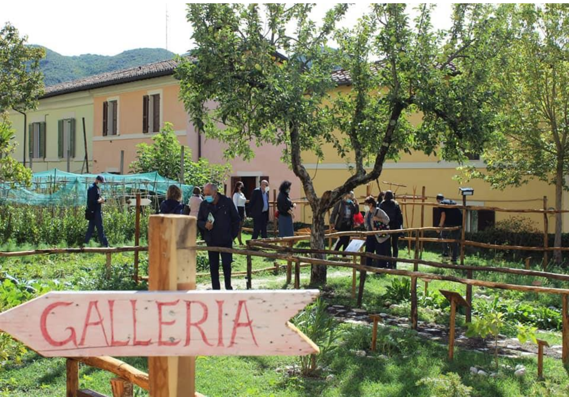
Art sowing, 2020 curated by Annalisa Ferraro, Orto Botanico Medievale , Rieti, Italy