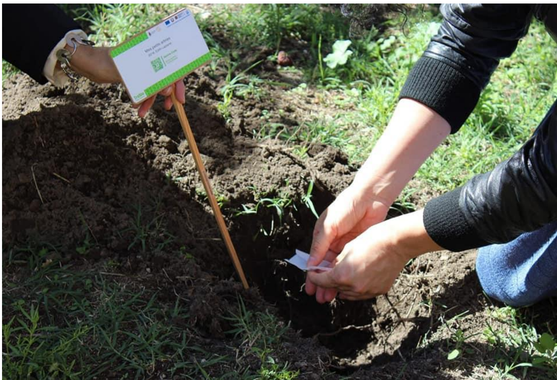
Art sowing , 2020 curated by Annalisa Ferraro, project TraMe-Tracce di Memoria, Agency The Uncommon Factory, Regione Lazio and Fondi FESR. Museo Civico, Orto Botanico Medievale and Porta San Giovanni, Rieti, Italy