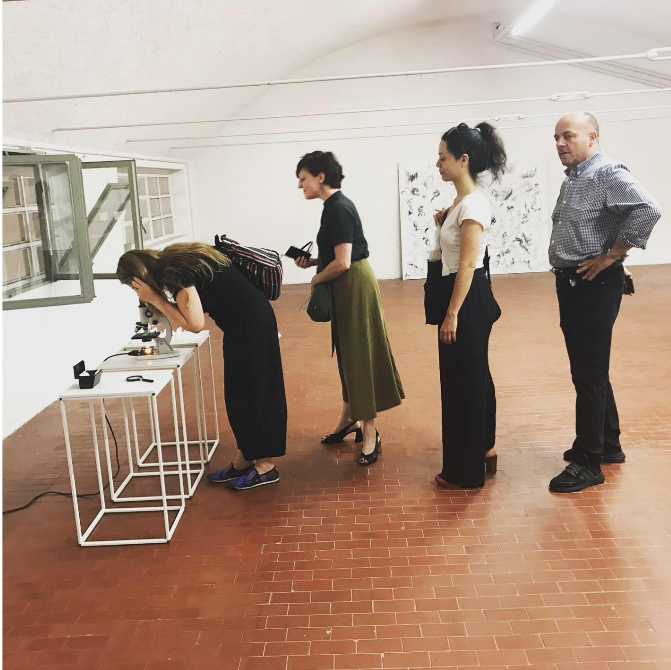
Testimoni Oculisti, 2019, Zentrum, Varese, Italy