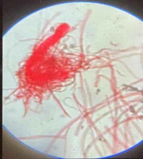
Window, group video-Sketch, May 2020, Dreiviertel, Berne, Switzerland