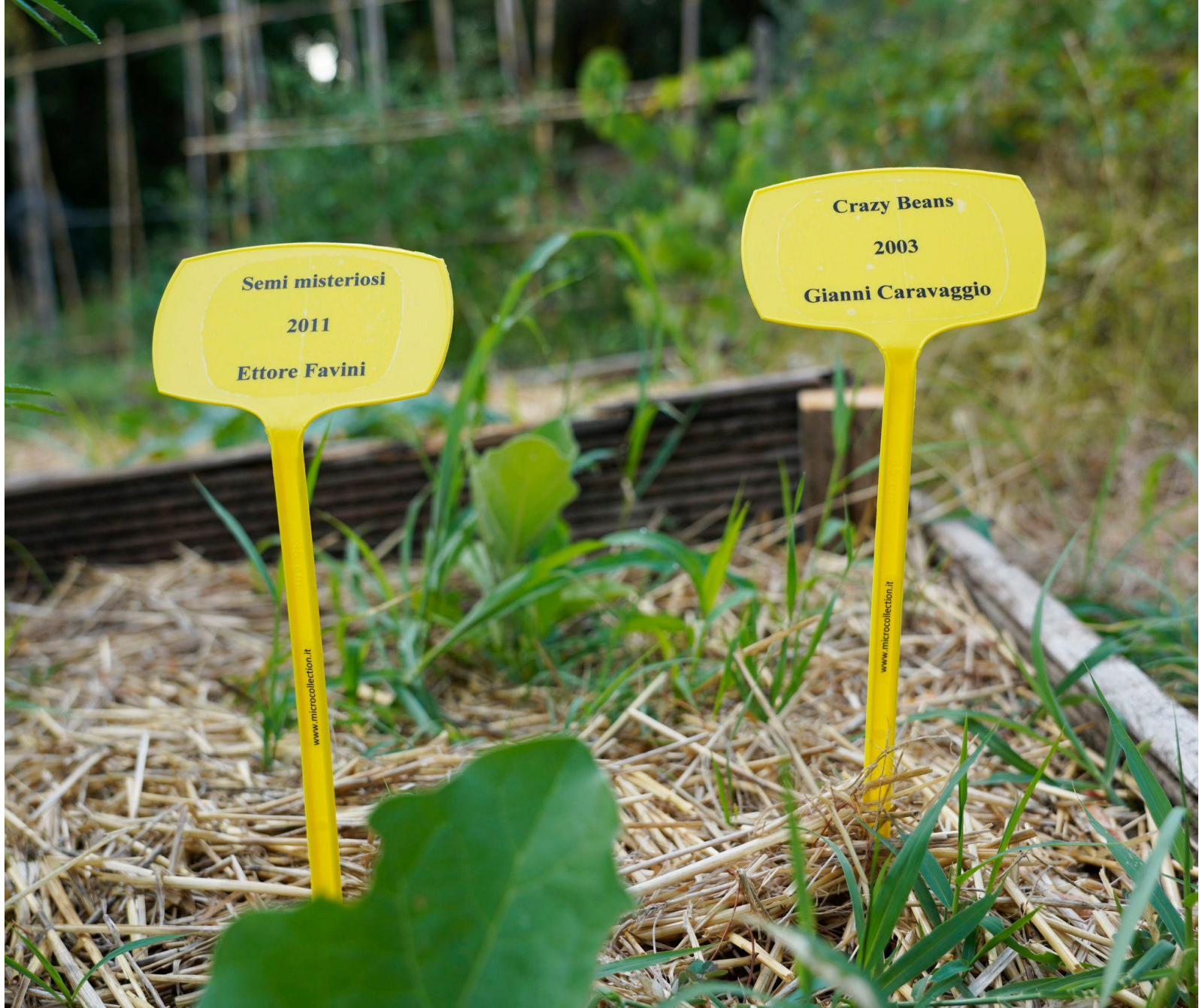
Art sowing , 2020 curated by Giorgio Barrera, Fattoria Montanine, Florence, Italy