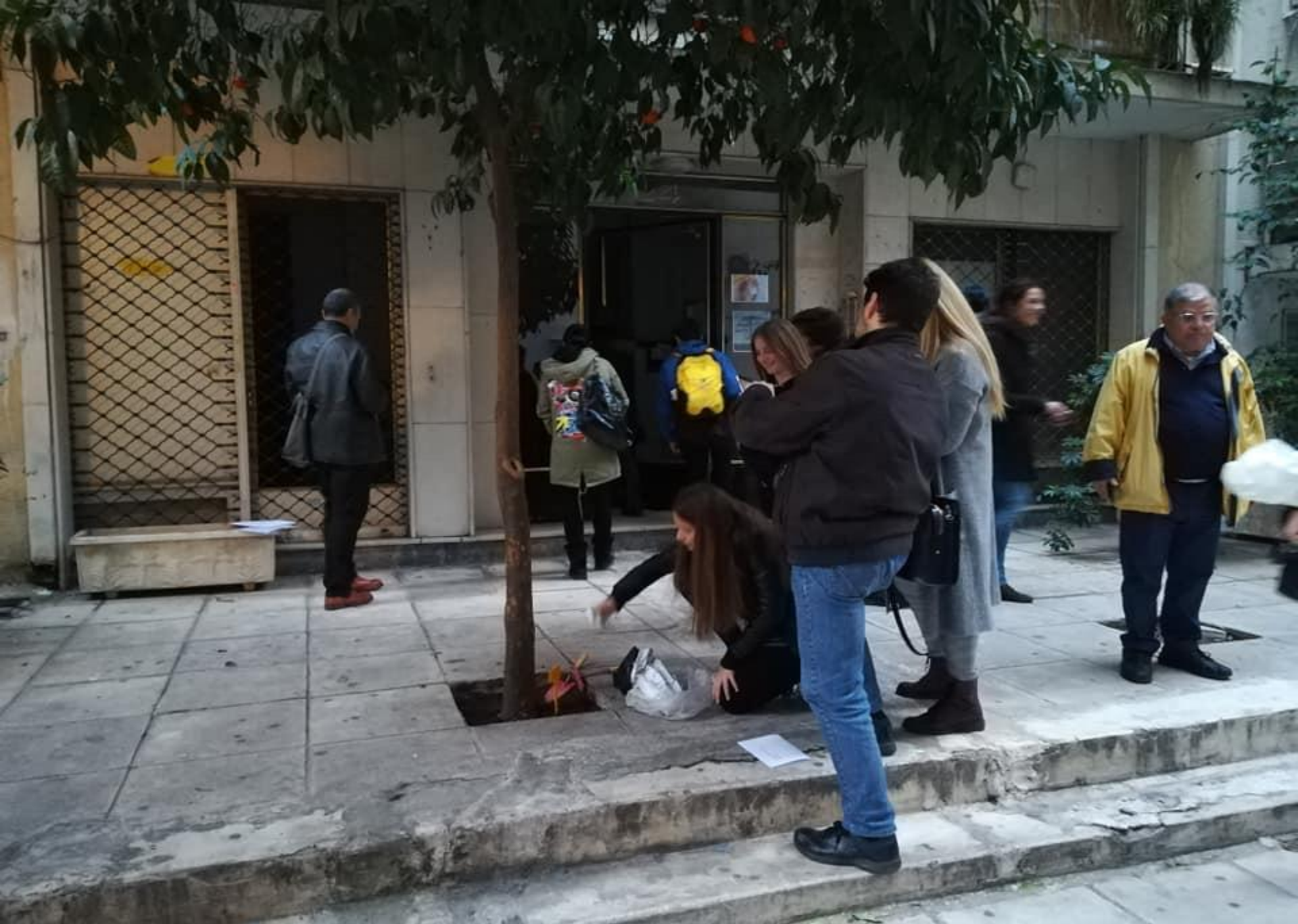
Art sowing: 7-meter Tree, 1980-82 by Giuseppe Penone, FokiaNou Art Space, Athens, 2019