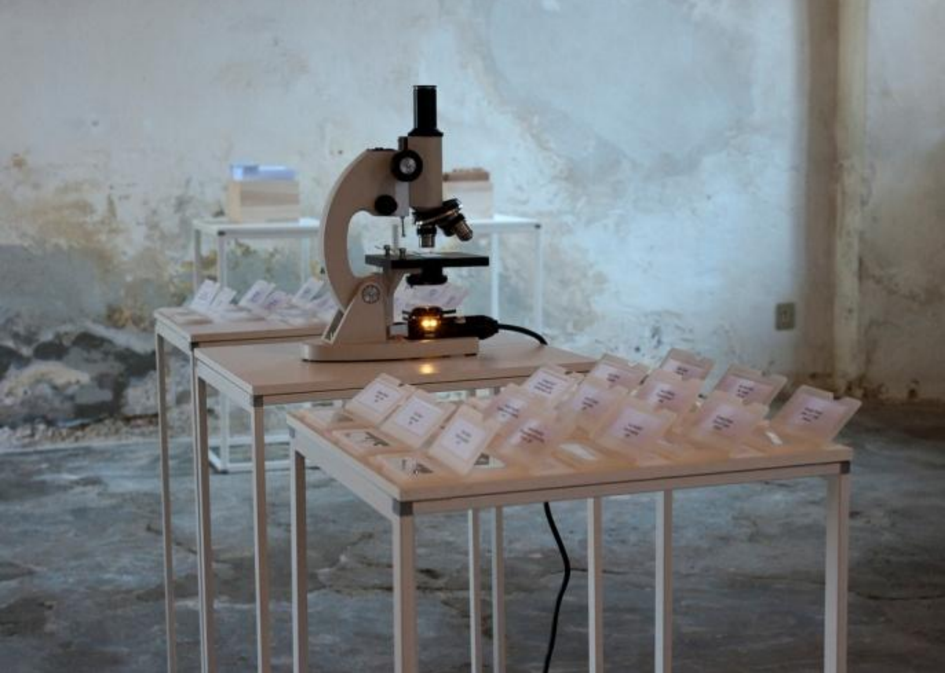
Utopia of an invisible museum, Cabinet de regard: waiting flowerbed , 2010, Castello di Jerago, Italy