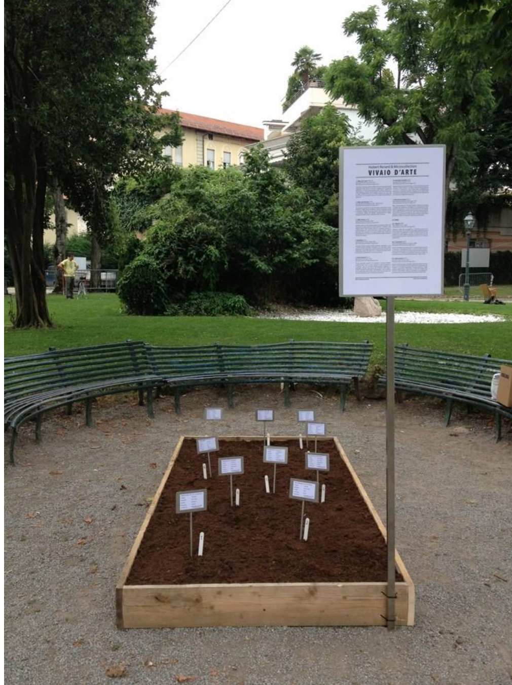
Art breeding ground in collaboration with Hubert Renard, ZOOart, 2014, Cuneo, Italy