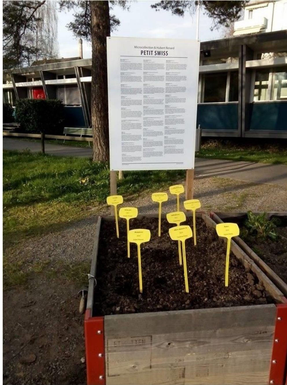
Art Sowing: Petit Swiss, 2015 in collaboration with Hubert Renard - Merkgarten, Zurich, Switzerland