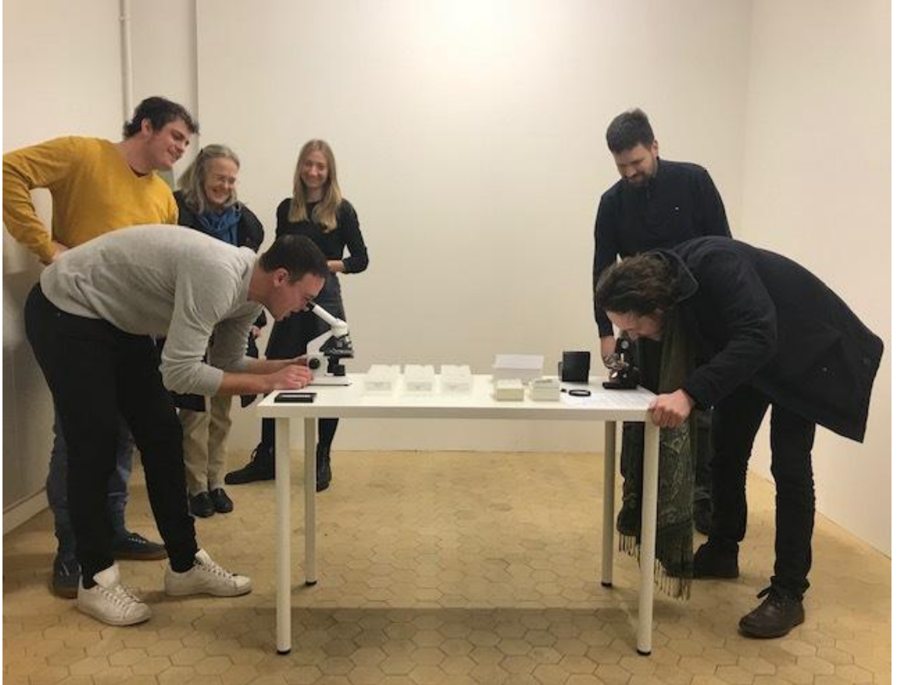
Cabinet de regard: MicroItalics , Kunstraum Dreiviertel, 2019, Bern, Switzerland