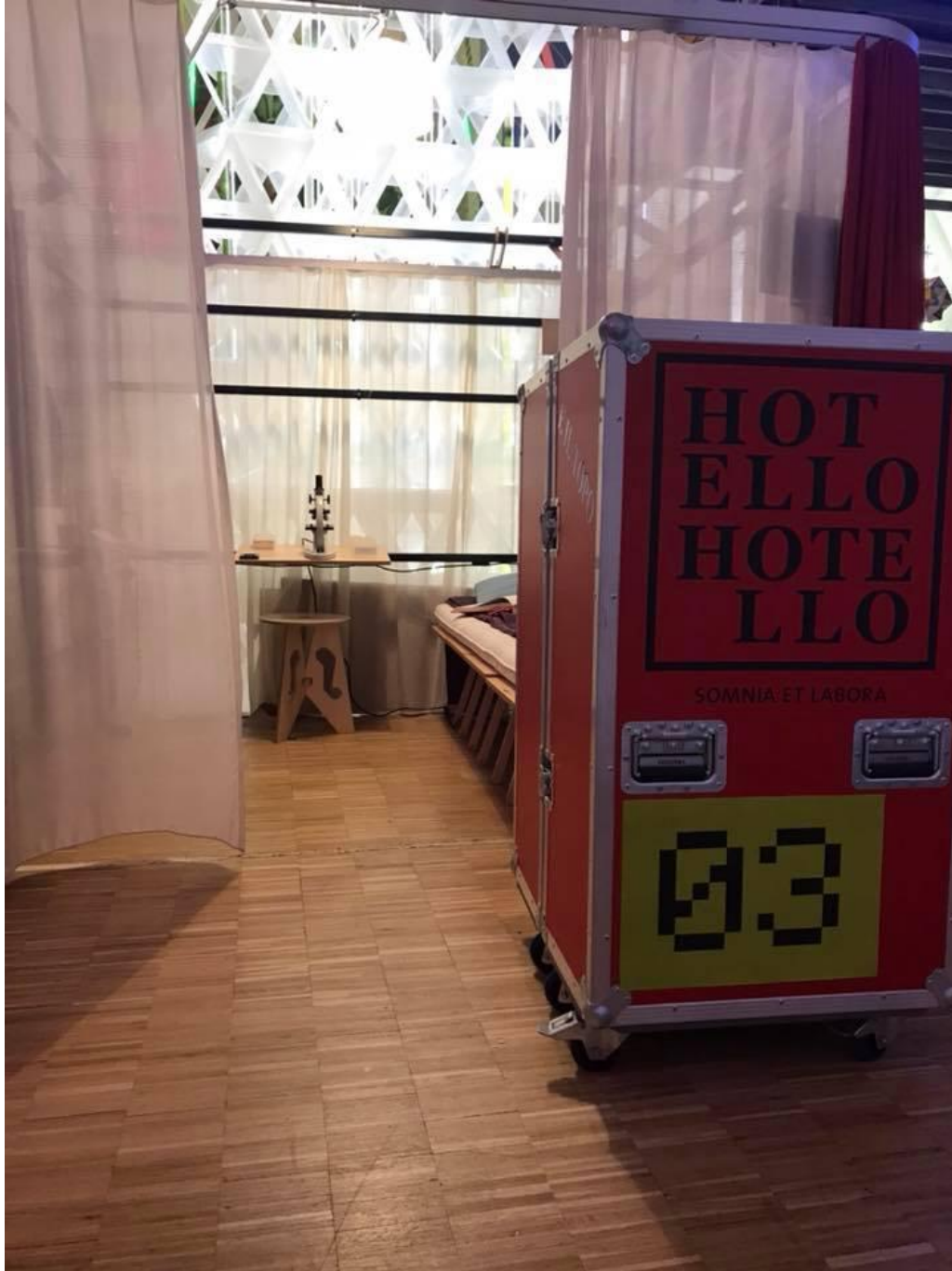
Cabinet de regard: micro&macro, 2018 in Hotello Abitare un ritardo, 999 domande, Triennale di Milano