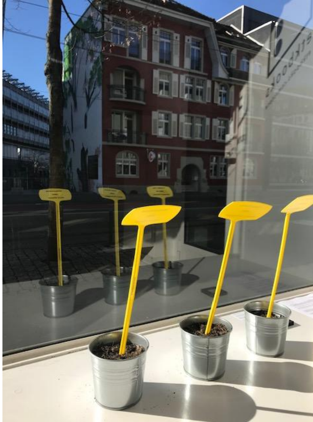
Art Sowing: Italian Art, Kunstraum Dreiviertel, 2019, Bern, Switzerland