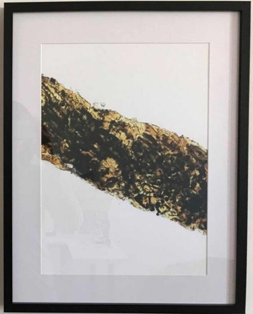
Summer collection: Pipilotti Rist & Mario Merz, 2017 - 2 photographs, cm 29.7 x 42, multiple 1/5