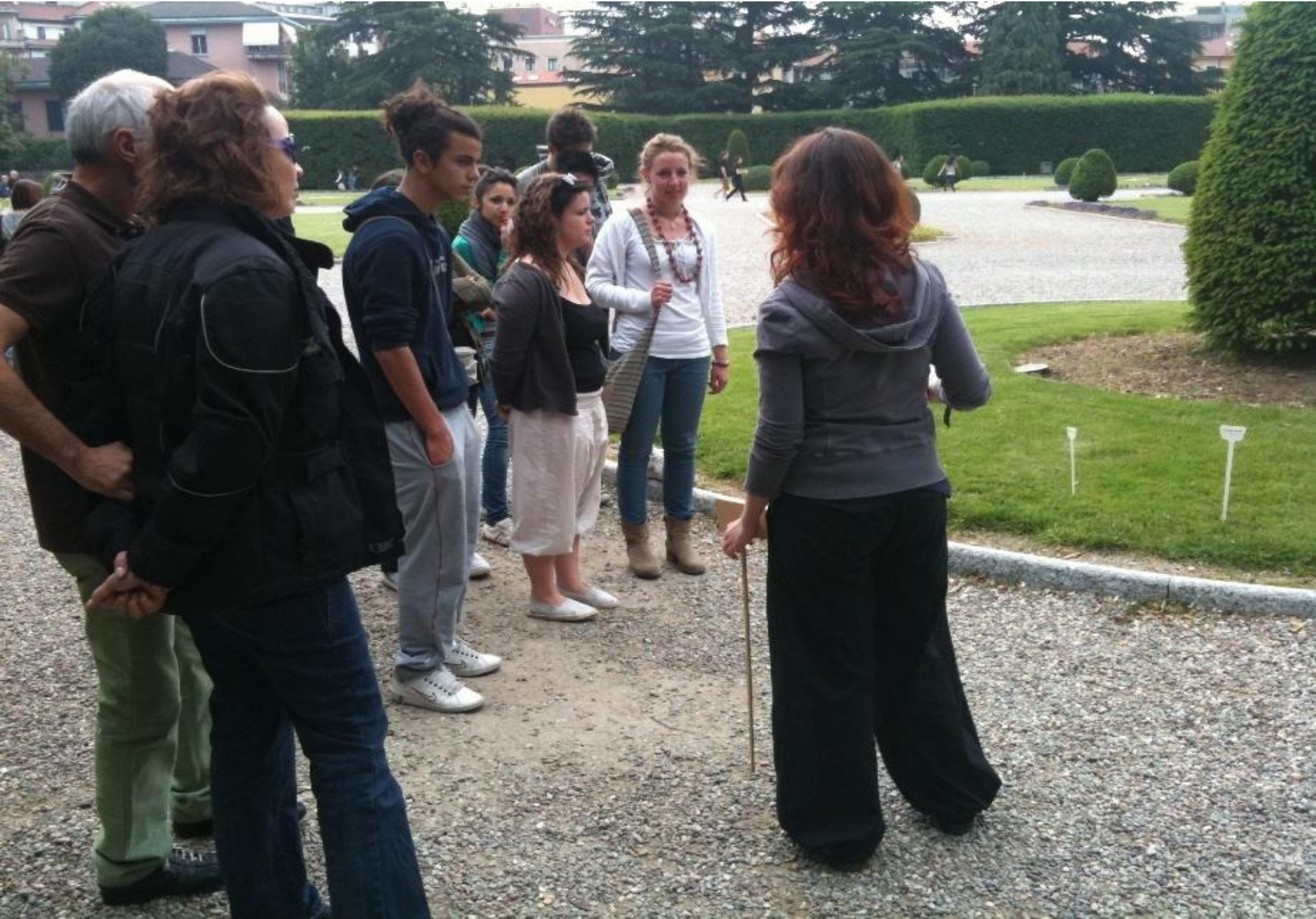
Guided Tours to Art Sowings in Art Day of Liceo Artistico Frattini, 2012, Varese, Italy