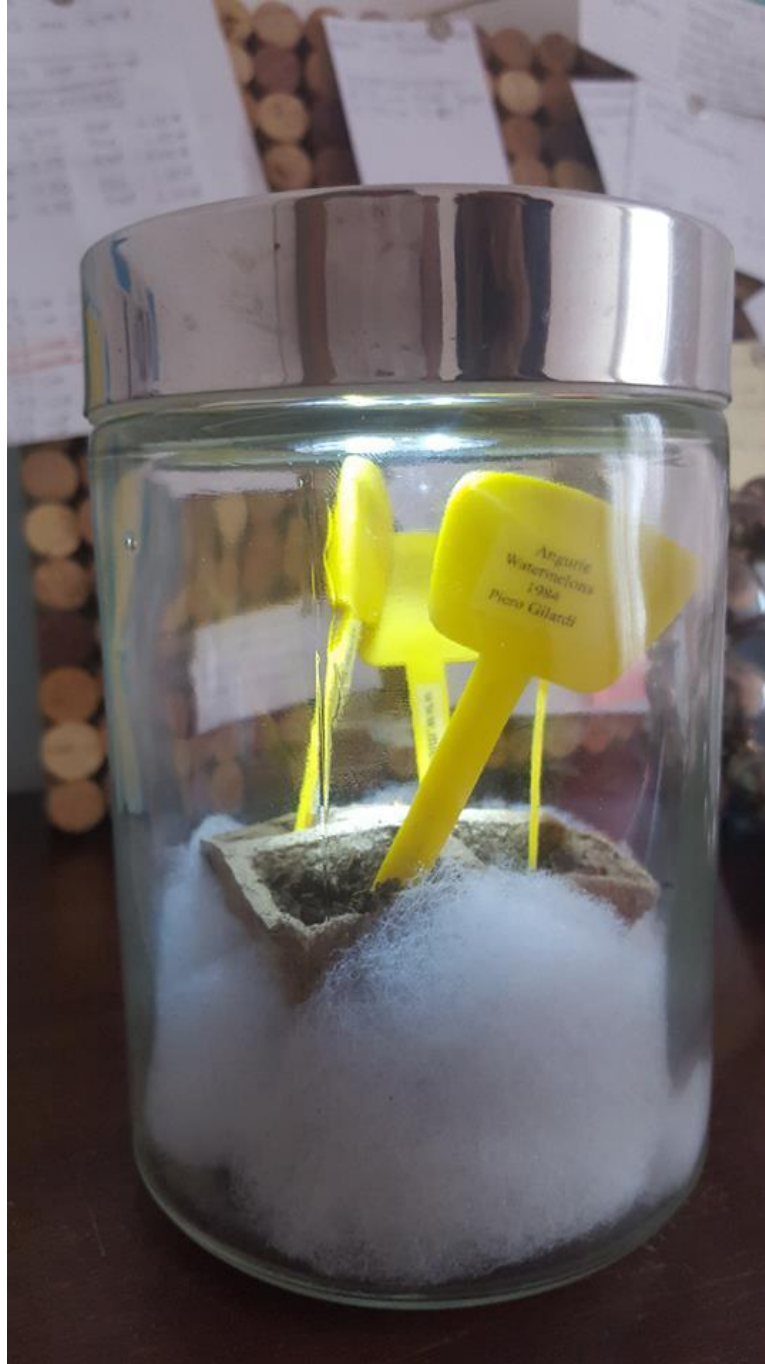
Sprout box: Watermelons, 1984, Piero Gilardi, 2016 - EMPATEMA, StudiFestival2, Milan, Italy