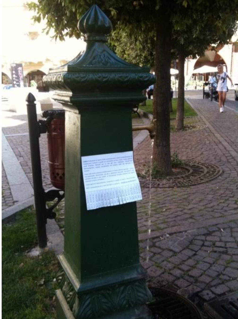
Microcollection is looking for new art fragments ...