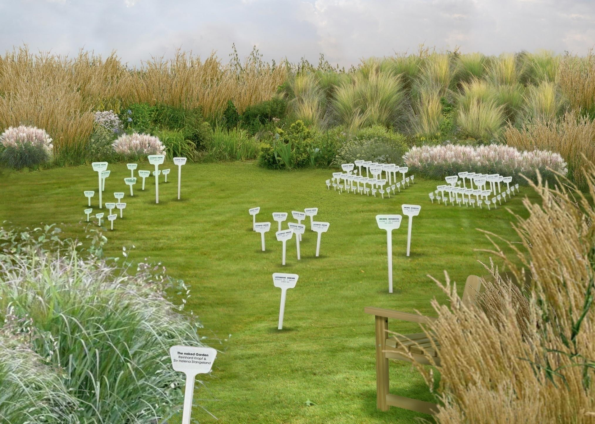
Microcollection selected Premio Pav 2011 - PAV Parco d'Arte Vivente, Turin, Italy