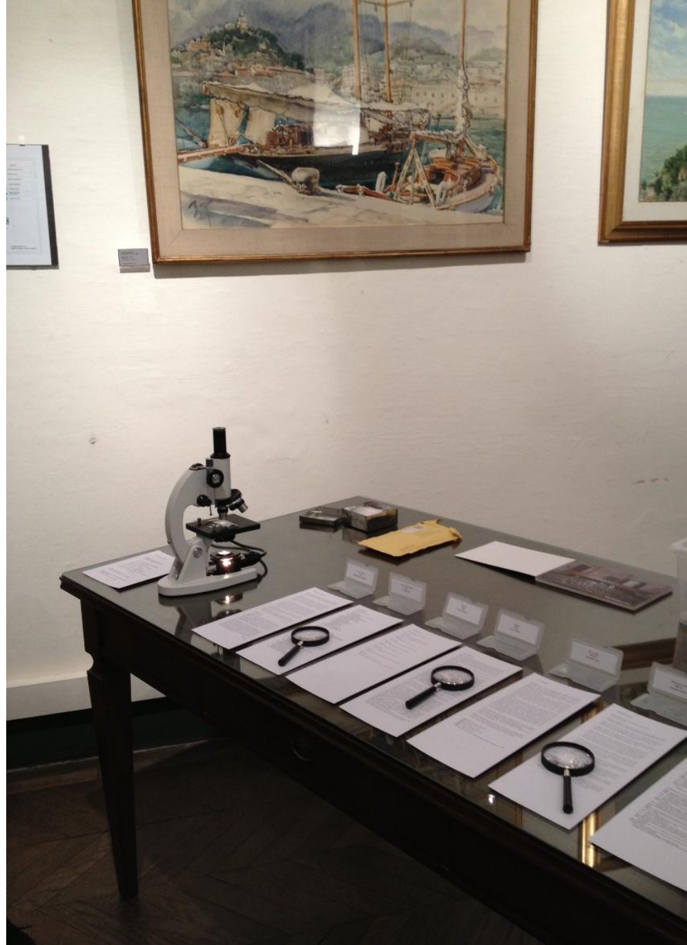
Cabinet de regard: Natura, 2014 - Museo Civico Palazzo Borea d'Olmo, Sanremo, Italy