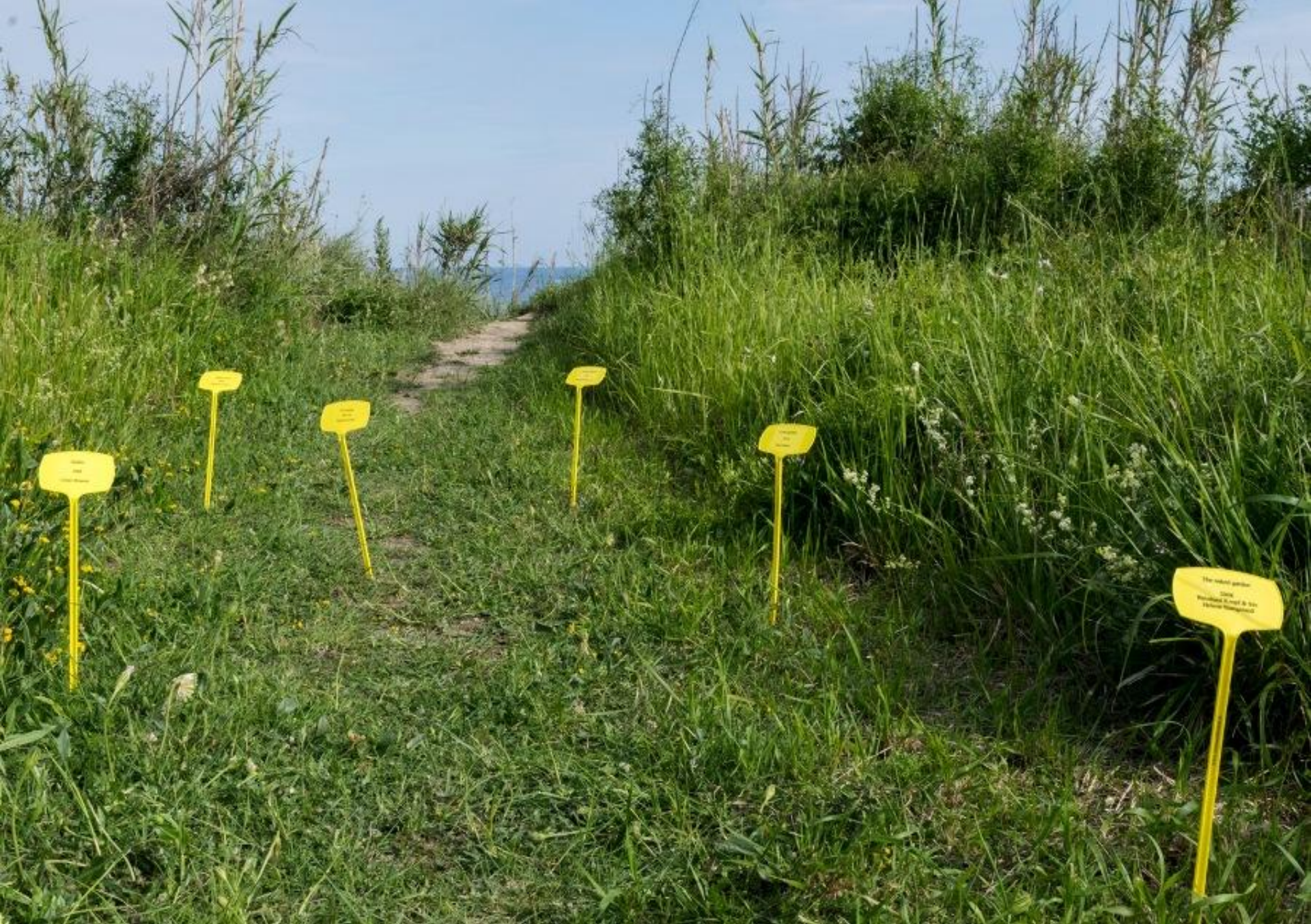
Art Sowing: Gardens, 2016, Susak Expo 2016, Susak, Croatia