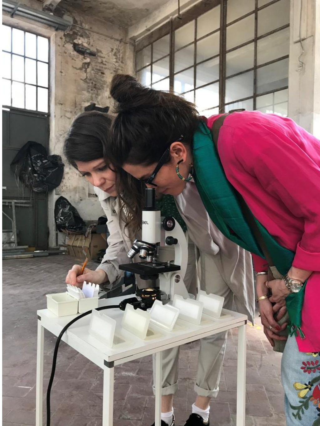
Cabinet de regard: micro&macro, 2018 - NoPlace4, Ex Ceramica Vaccari, Santo Stefano di Magra, SP