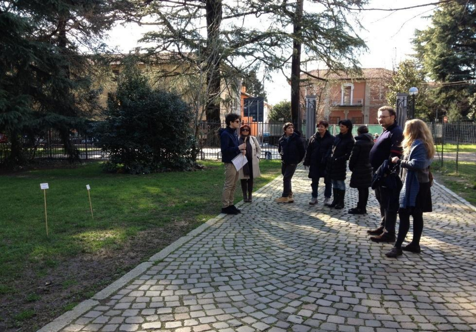
METTI IN CIRCOLO IL PITTORE, Guided tours to Art Sowing , 2014, Olgiate Olona, Italy ( Art Academy students acting as tourist guides )