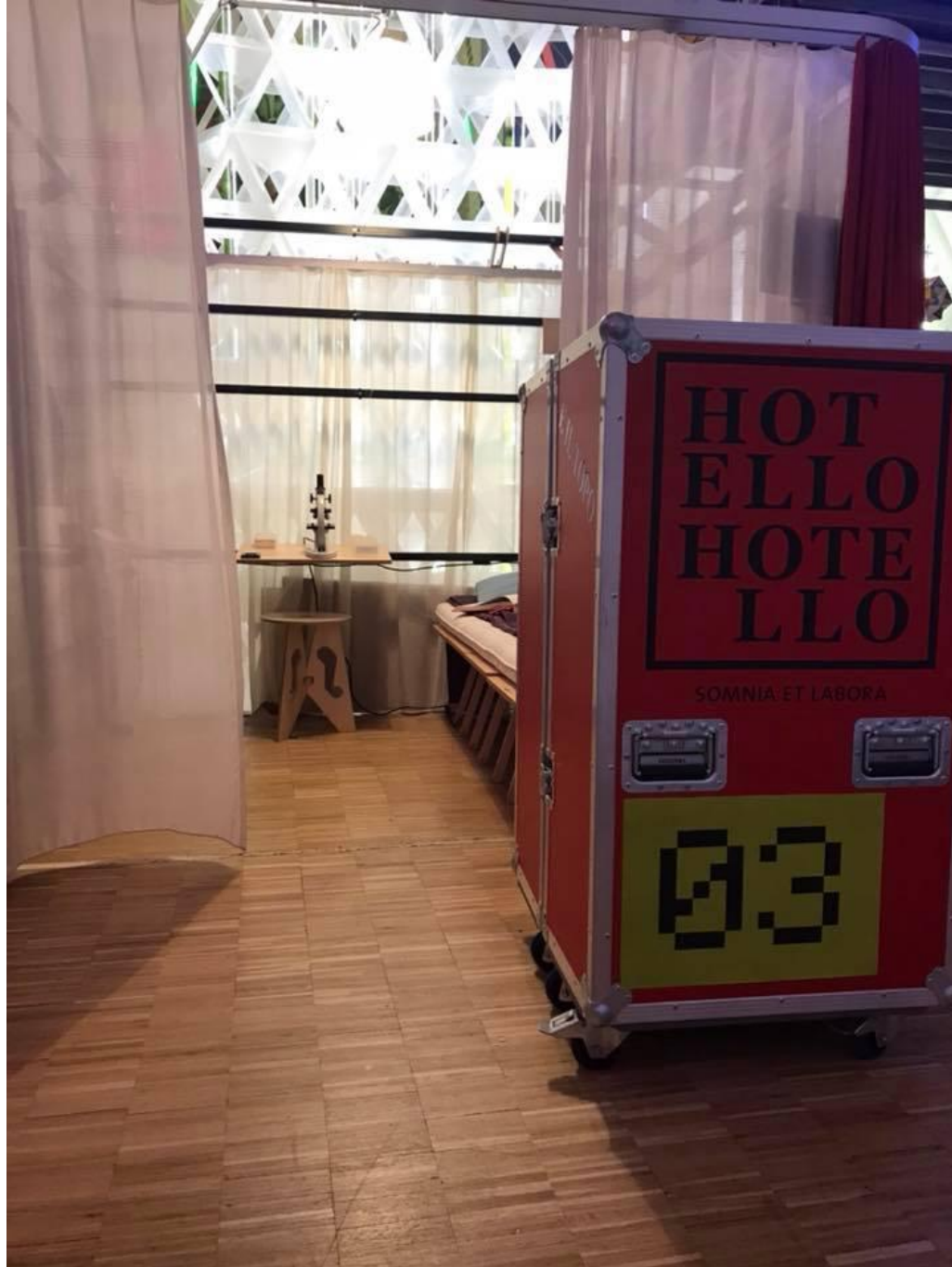
Cabinet de regard: micro&macro, 2018 in Hotello Abitare un ritardo, 999 domande, Triennale di Milano